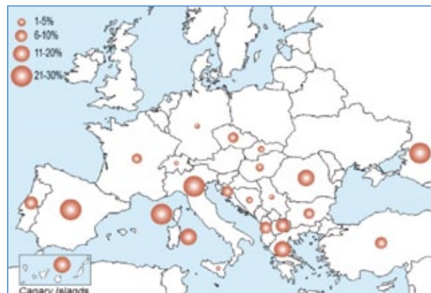
Mean prevalence rates. The current area where Dirofilaria immitis is considered endemic includes most countries in Southern and South-Eastern Europe.