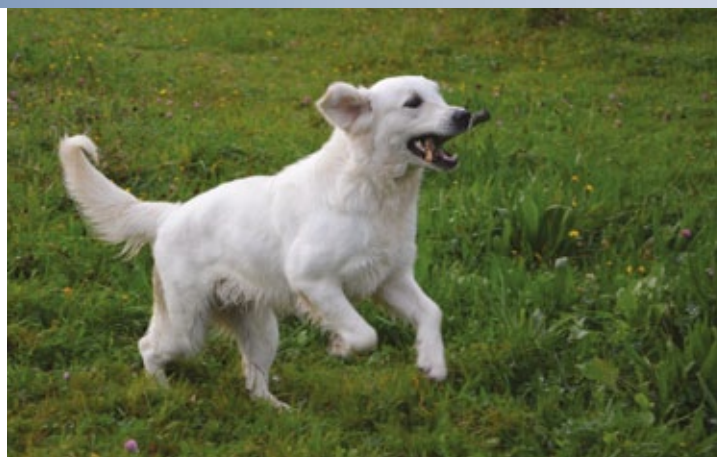
Exercise restriction is the most important factor to help minimise the risk of thromboembolism.